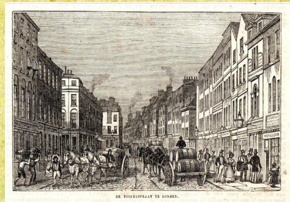
DE TOOLEYSTRAT TE LONDEN.

Hackney in 1840, The main road before the Advent Railway